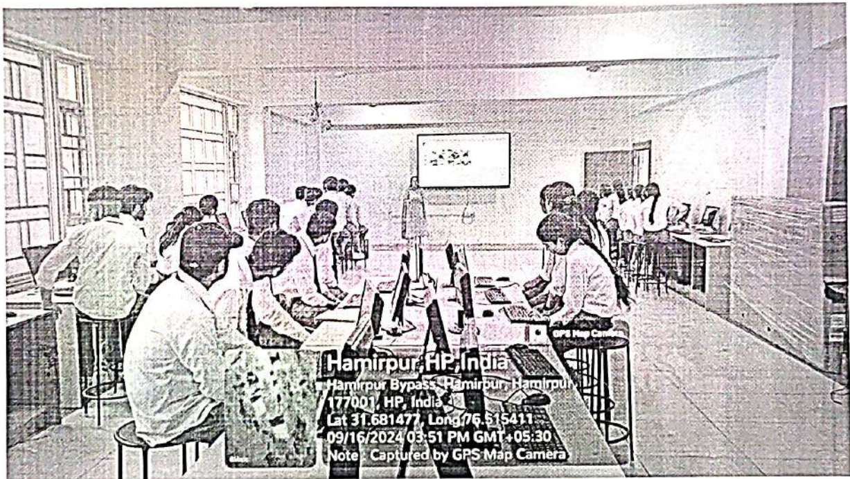
Image – 1 Students can be seen attending the lecture in the computer Lab which is also equipped with Smart Class Room LCD.

Computer Lab at Gautam College of Pharmacy, a state-of-the-art facility designed to enhance the learning experience of our students. The lab is equipped with 41 high-performance computers, each configured with the latest software and tools relevant to pharmacy education and research. The spacious and well-lit environment promotes collaboration and productivity, featuring ergonomic workstations to ensure comfort during long study sessions. High-speed internet access is available throughout the lab, allowing students to conduct research, access online resources, and collaborate on projects seamlessly.