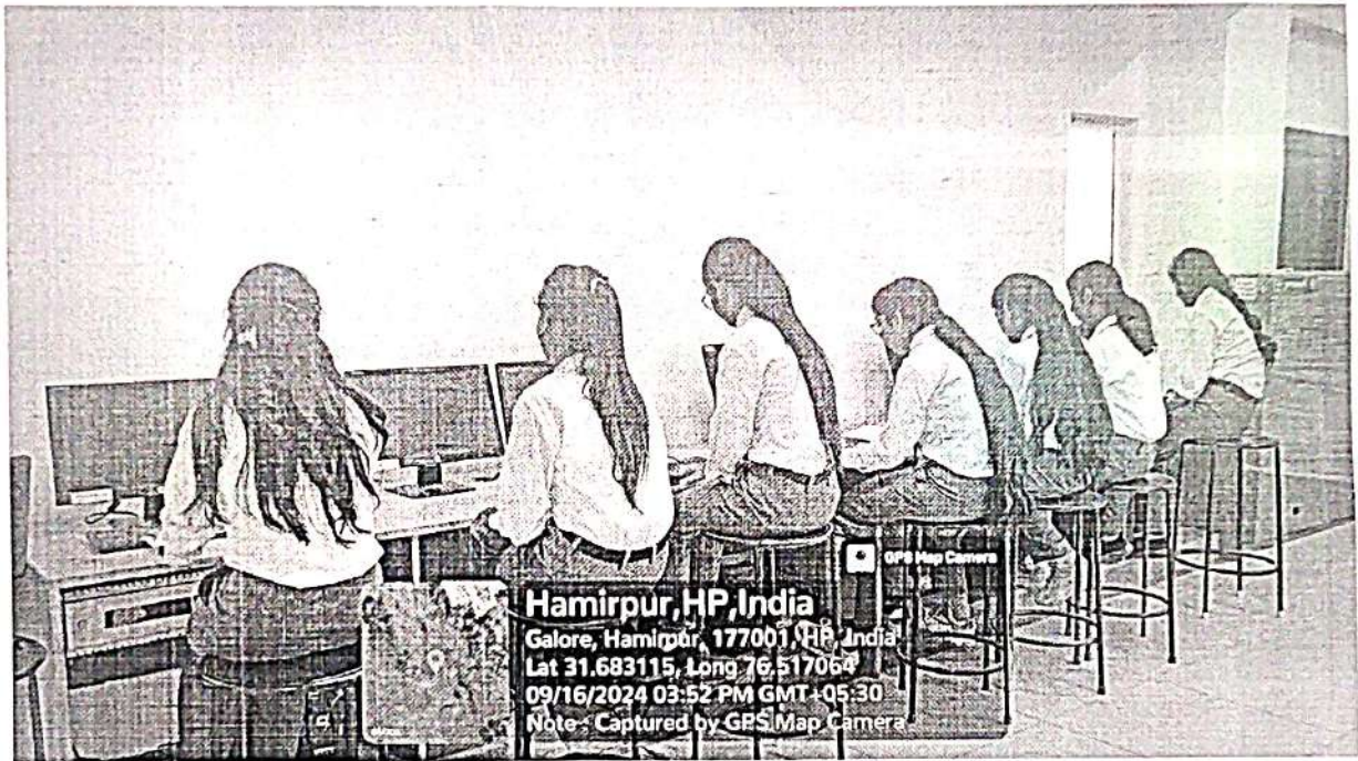
Image – 2 Pictures of students in the computer lab

Gautam College of Pharmacy recognizes the importance of community engagement in education. The Computer Lab plays a crucial role in outreach programs aimed at raising awareness about health issues within the local community. Students often utilize the lab to prepare educational materials and presentations for workshops.