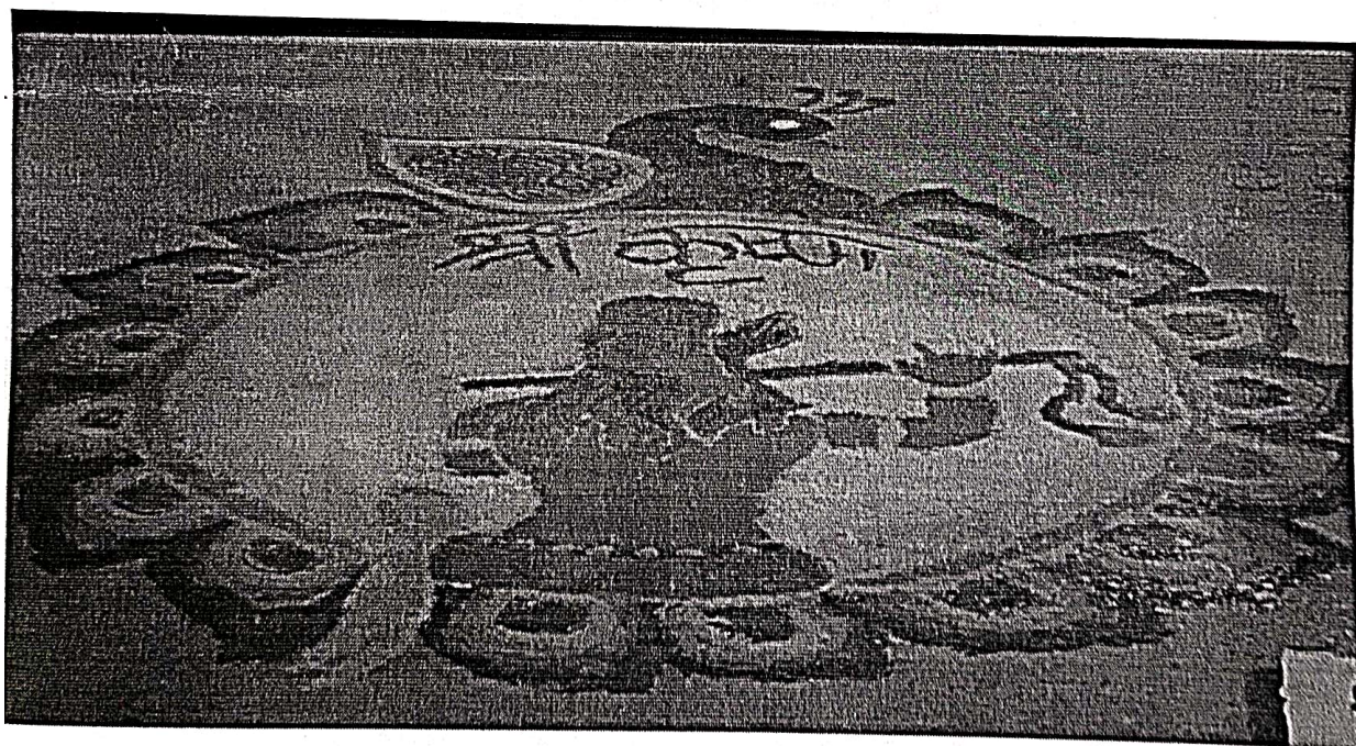
Fig 3: Rangoli made by 3 rd year students & won first prize